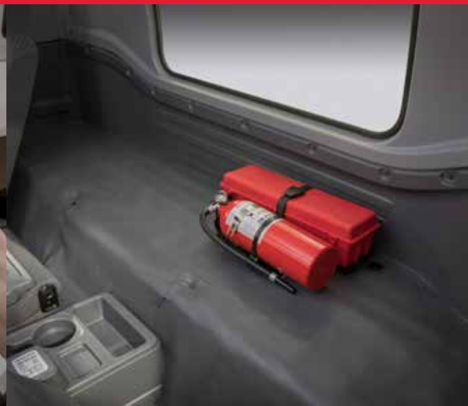
Fire Extinguisher and Reflector Kit