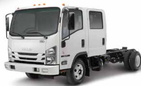
CREW CAB SEATING FOR UP TO 7