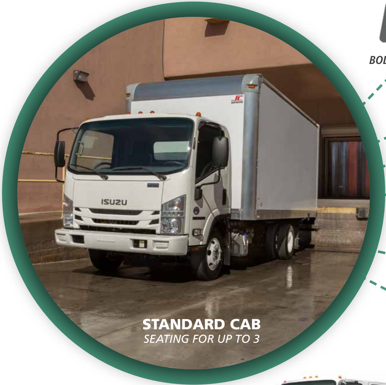
STANDARD CAB SEATING FOR UP TO 3